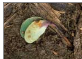
Phytophthora damping off