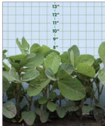
Untreated Roundup Ready® Soybeans