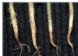
Damping off by Pythium

Acceleron utilizes imidacloprid to reduce early season damage to soybeans caused by insect pests including aphids and bean leaf beetles.