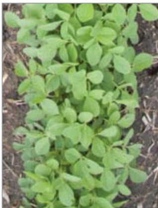
Genuity™ Roundup Ready 2 Yield® Soybeans with Acceleron™