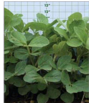
Genuity™ Roundup Ready 2 Yield® Soybeans with Acceleron™