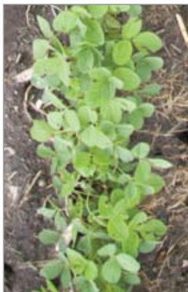
Untreated Roundup Ready® Soybeans