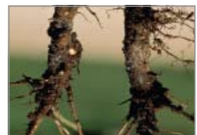
Fusarium root rot